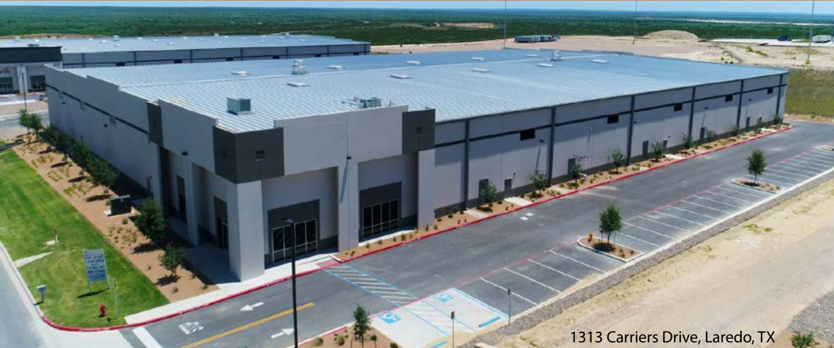
1313 Carriers Drive, Laredo, TX