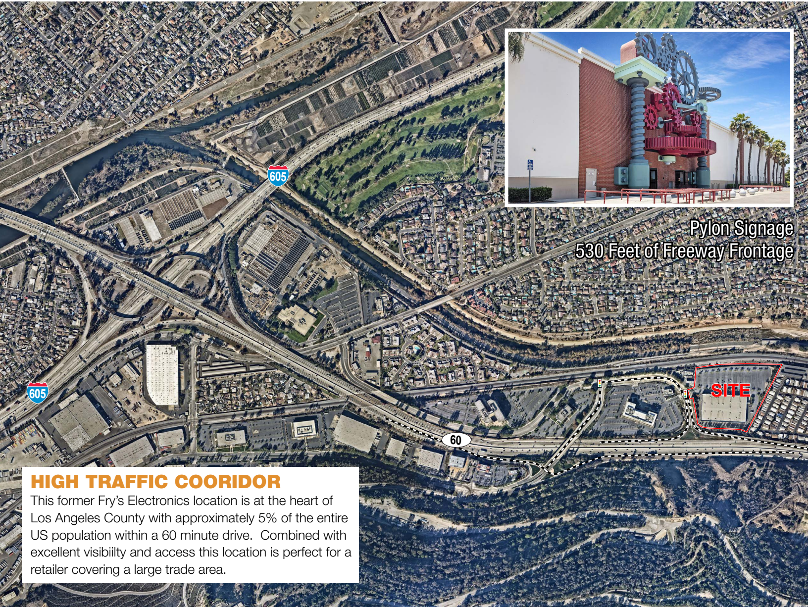
Pylon Signage 530 Feet of Freeway Frontage

LOCATED AT THE CONVERGENCE OF THE 60 AND 605 FREEWAYS