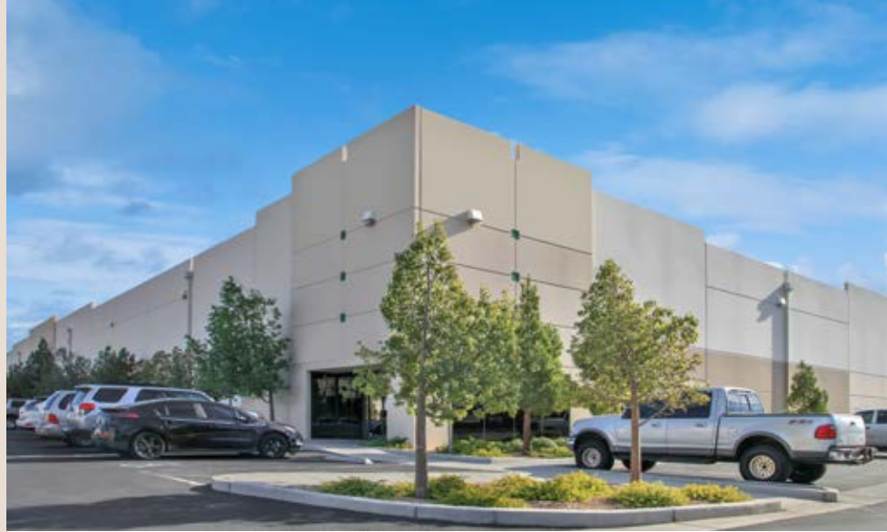
3655 W. Sunset Road, Suite D, Las Vegas, Nevada 89118