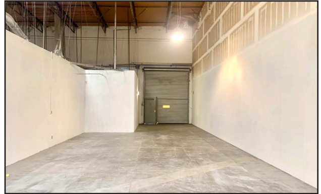
14375 Pipeline Avenue, Chino, CA (7,806 SF)